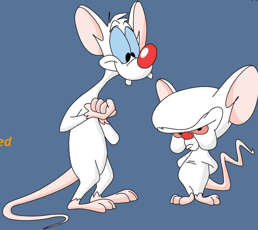
PINKY & BRAIN